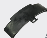
Plastic protection suitable for bead breaker