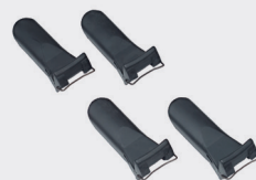
Plastic protection jaws